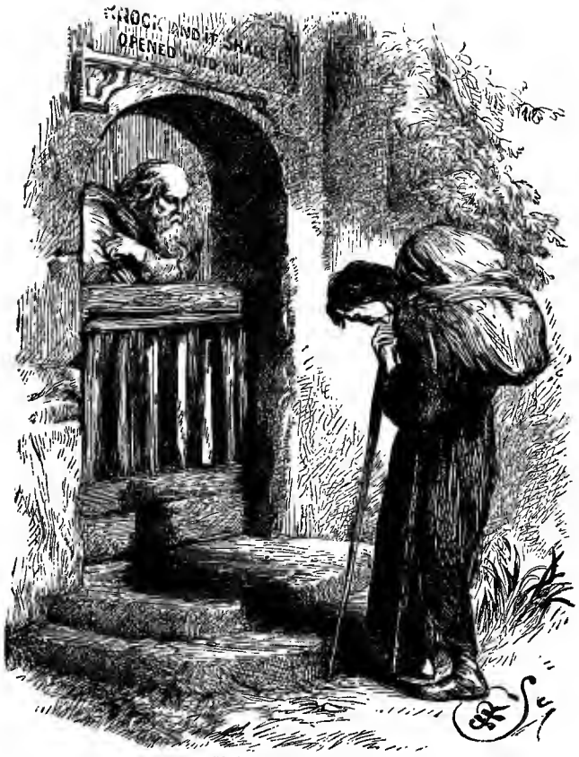
Christian at the Gate. .